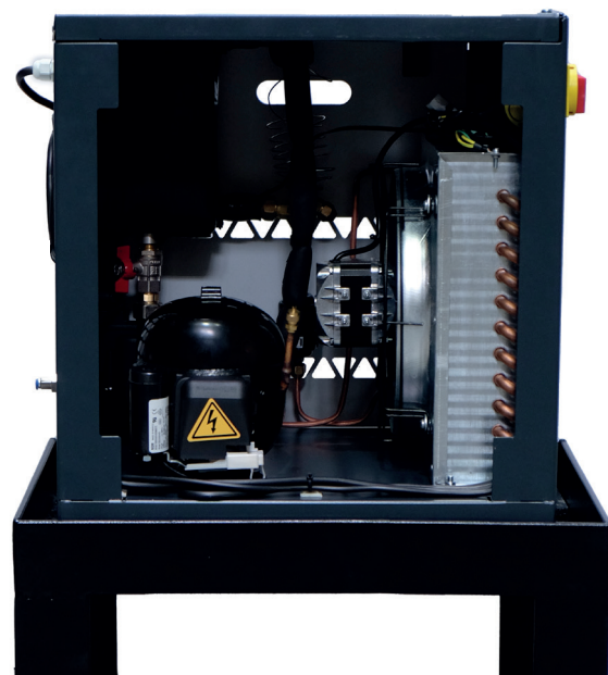
easy access to the clear structured interior