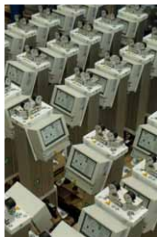
ATK-APN order is being prepared for dispatch