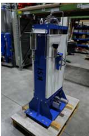
ATKN-HP 500 adsorption dryer

We are delighted to see the results of participating during exhibitions and to help our partners in increasing their position in the market. This is a team effort!