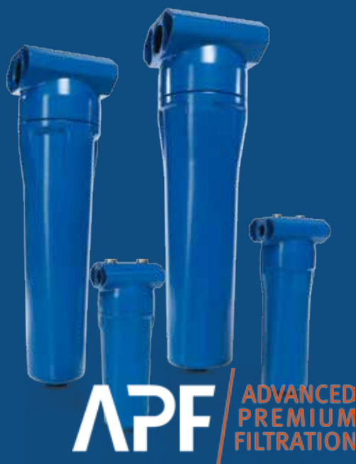
APF / ADVANCED PREMIUM FILTRATION