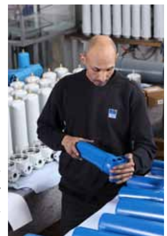
Inhouse quality control