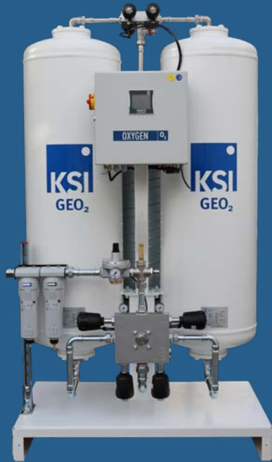
ECOTROC GEO 2