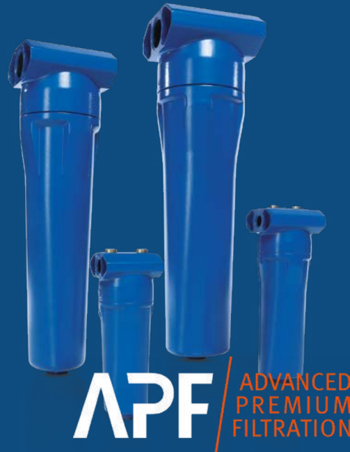
APF / ADVANCED PREMIUM FILTRATION