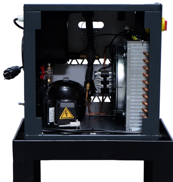
easy access to the clear structured interior